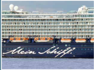
Cruise & Ferry