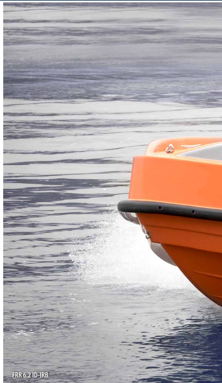
FRR 6.2 ID-IRB